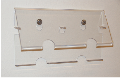
Ref no 2510- empty

New EasyOn plaster are easy and comfortable to use!!