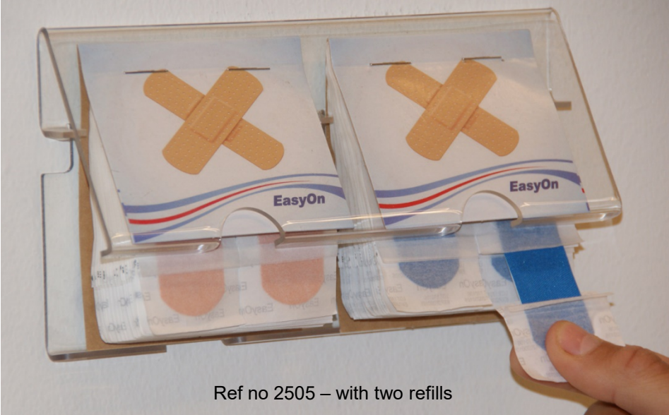
Ref no 2505 – with two refills